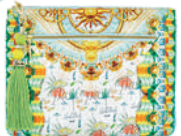
Printed clutch, £99, Camilla at Beach Café

STOCKISTS: ACCESSORIZE.UK, ACCESSORIZE.COM; BEACH CAFE, WWW.BEACHCAFE.COM; FINISTERRE WWW.FINISTERRE.COM; HARLEY STREET DENTAL & IMPLANT CLINIC, WWW.HARLEYSTREETDENTALCLINIC.COM; MINT VELVET WWW.MINTVELVET.CO.UK; O'NEILL WWW.O'NEILL.COM; GBN/HOME; SWEETLIME WWW.SWEETLIME.CO.UK; TOPSHOP WWW.TOPSHOP.COM