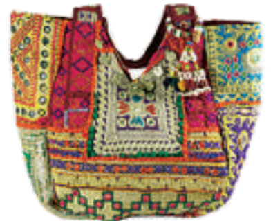
Patchwork bucket bag, £75, Sweetlime