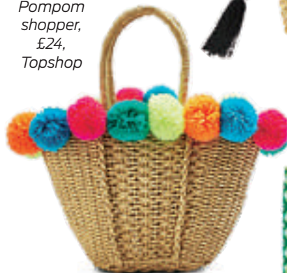
Pom-pom shopper, £24, Topshop