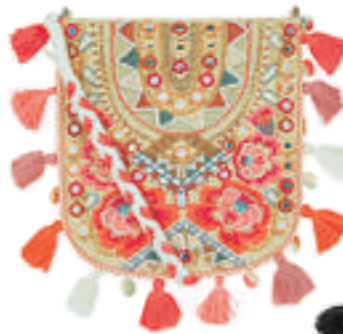
Tassel saddlebag, £29, Accessorize