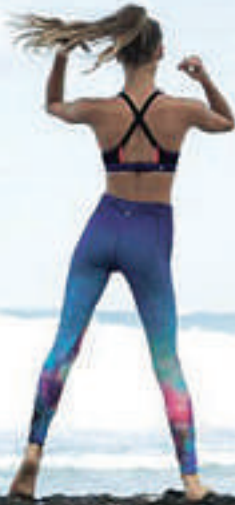
Sports bra, £34.99, and leggings, £59.99