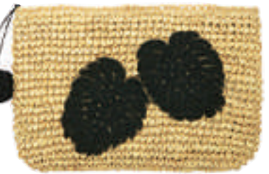
Straw clutch, £45, Mint Velvet