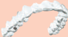
Invisalign is priced from £1,995